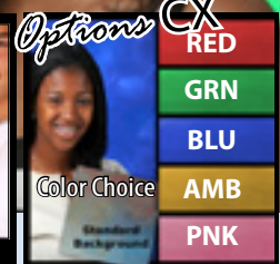
elegir el color

Help Wanted! We need parent helpers on picture day. We provide a free student picture package with "ALL OPTIONS" for helpers. Please apply at www.abcschoolportraits.com Se necesita ayuda! Necesitamos a padres para ayudarnos en día de foto. Ofrecemos un paquete gratis de fotografía del estudiante con "todos las opciones" para los ayudantes. Aplican por favor en www.abcschoolportraits.com .