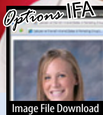
la imagen de descarga de archivos