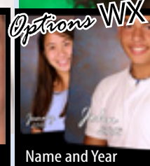
nombre y año