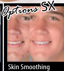
suavizar la piel