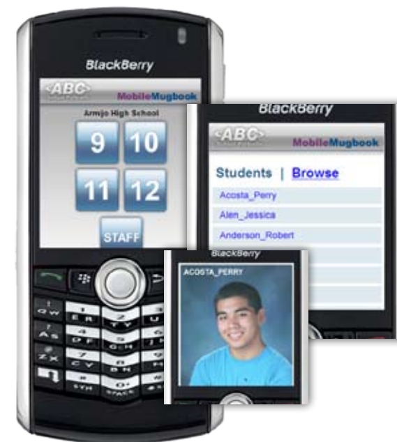
Phone Not Included

Available to Staff, Security, and Police